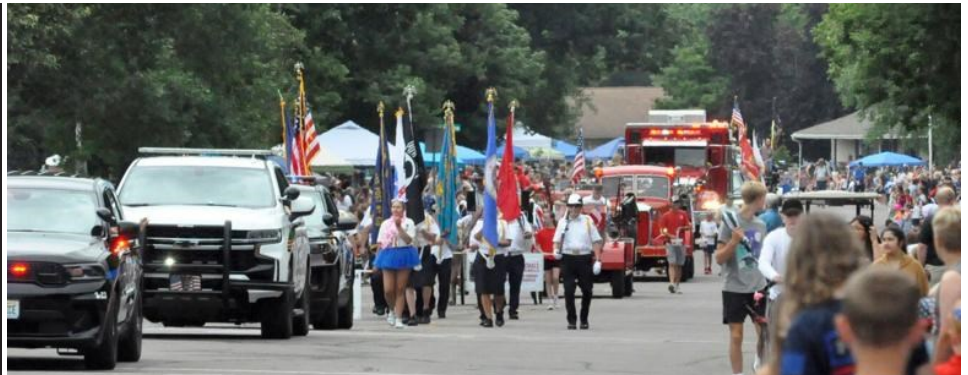
American Legion Post 37 led the parade at the annual Chamber of Commerce 4th of July parade. Thank you for your dedication of representing our nation!